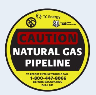
MARKER "BULLET" POST